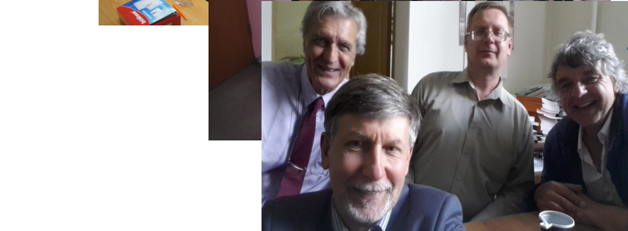
The RCE project team